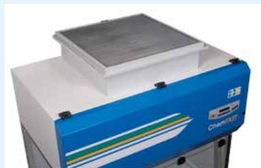
Additional filter housing re-circulating type